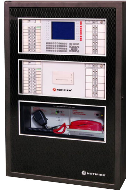
N-6000 with FSS-TCC and FSS-VCC

FSS-AFAWS: Fireman’s telephone extension set, compatible with FSS-TCC. Able to communicate with FACP. Includes front door, backbox and telephone assembly. These Emergency Telephone Stations provide a reliable means of communication for firefighters and other personnel.